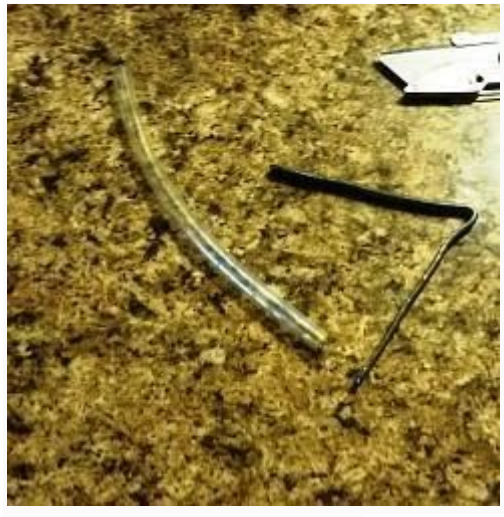
lead tool inserted in tubing